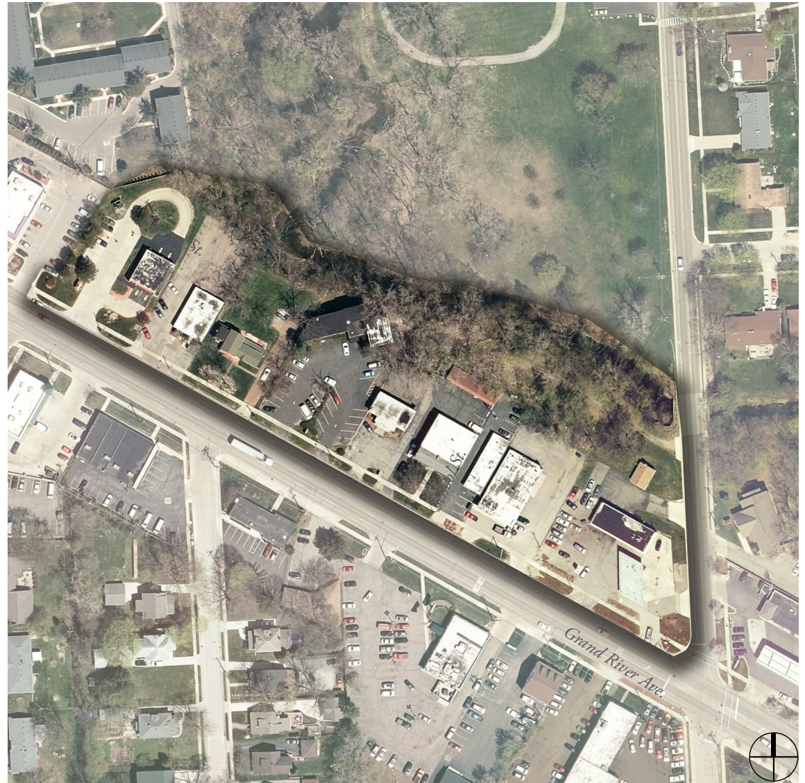
FIGURE 3.16 SUBAREA E - EXISTING CONDITION