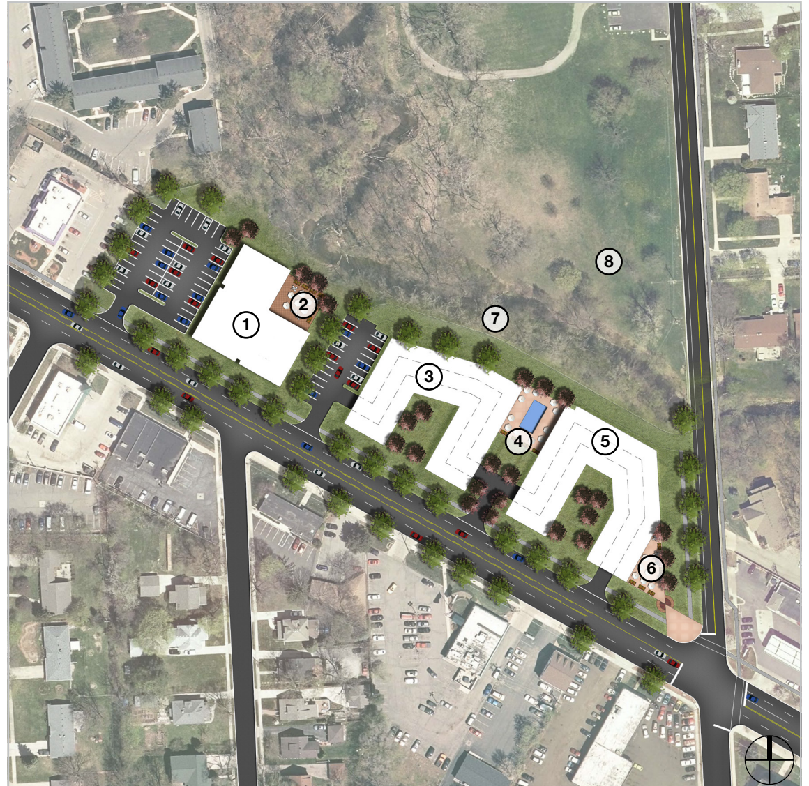
FIGURE 3.19: CONCEPT 2