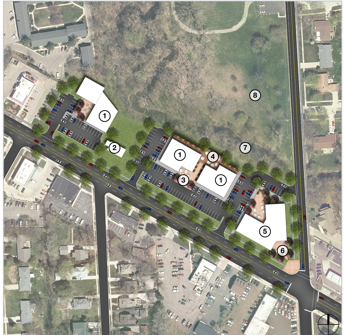
FIGURE 3.20: CONCEPT 3