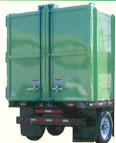
There are two rear, side hinged doors which lock easily to the side for dumping. Strong cam-type rods lock the door closed.