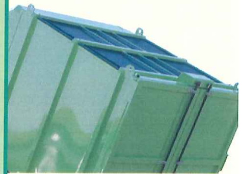
Two (14,20CY) or Three (25,30CY) removable 1/2" expanded steel screens are located on the top for proper ventilation. The screens are easy to change from the side by removing two bolts.