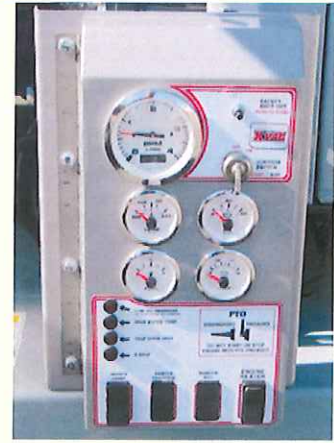
Hinged instrument panel allows easy access to the instrument wiring. All engine monitoring gauges are backlit for increased visibility.