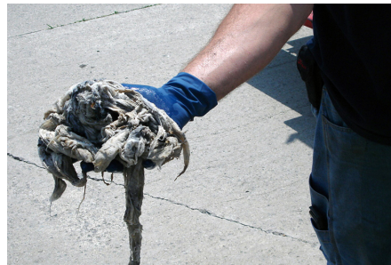
Nonwoven wipes clog sewers and equipment in pump stations and wastewater treatment plants because they don't break apart in water. The extra maintenance required to remove them comes at a cost to all sewer system users.